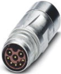
Coupler connector, straight, SPEEDCON locking, M17, Number of positions: 17, Type of contact: Male connector, Crimp connection, shielded: Yes, Cable diameter: 9 mm...11 mm

Please be informed that the data shown in this PDF Document is generated from our Online Catalog. Please find the complete data in the user's documentation. Our General Terms of Use for Downloads are valid ( http://download.phoenixcontact.com )