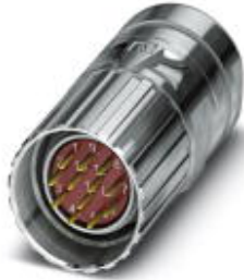
Cable connector, straight, shielded: Yes, Screw locking, M23, Number of positions: 12, Type of contact: Male connector, Crimp connection, Cable diameter: 6 mm ... 10 mm

Please be informed that the data shown in this PDF Document is generated from our Online Catalog. Please find the complete data in the user's documentation. Our General Terms of Use for Downloads are valid ( http://download.phoenixcontact.com )