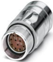
Coupling connector, straight, shielded: Yes, SPEEDCON locking, M23, Number of positions: 12, Type of contact: Socket, Crimp connection, Cable diameter: 6 mm ... 10 mm

Please be informed that the data shown in this PDF Document is generated from our Online Catalog. Please find the complete data in the user's documentation. Our General Terms of Use for Downloads are valid ( http://download.phoenixcontact.com )