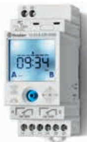
Type 12.A2.8.230.0000 2 CO (DPDT) 16 A 110...230 V AC/DC