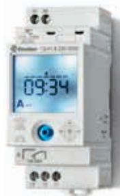
Type 12.A1.8.230.0000 1 CO (SPDT) 16 A 110...230 V AC/DC