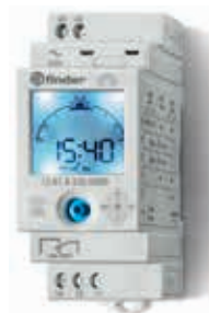
Type 12.81.8.230.0000 1 CO (SPDT) 16 A 110...230 V AC/DC

Suitable for a wide range of applications such as heating, lighting and irrigation...