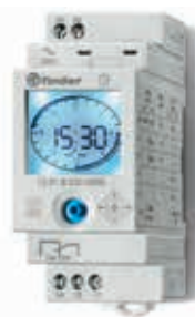
Type 12.51.8.230.0000 1 CO (SPDT) 16 A 110...230 V AC/DC

Irrigation systems, heating and cooling plant, shops, illuminated signs, access (door) control.