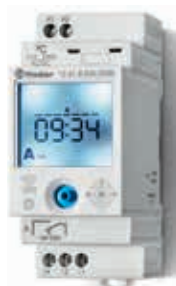
Type 12.61.8.230.0000 1 CO (SPDT) 16 A 110...230 V AC/DC

Municipal lighting (street, squares, monuments, fountains...) gardens, parking, shops, illuminated signs, irrigation systems, heating and cooling plant.