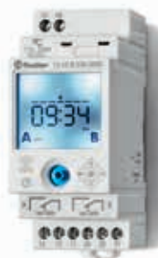
Type 12.62.8.230.0000 2 CO (DPDT) 16 A 110...230 V AC/DC