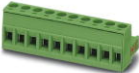
Plug component, Nominal current: 16 A, Rated voltage (III/2): 320 V, Number of positions: 9, Pitch: 5.08 mm, Connection method: Screw connection, Color: green, Contact surface: Tin

Please be informed that the data shown in this PDF Document is generated from our Online Catalog. Please find the complete data in the user's documentation. Our General Terms of Use for Downloads are valid ( http://download.phoenixcontact.com )