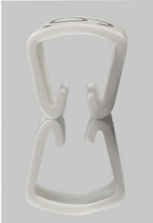
Product is similar to illustration