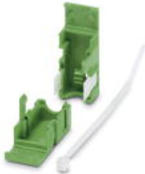
Cable housing, Pitch: 0 mm, Number of positions: 2, Dimension a: 10 mm, Color: green

Please be informed that the data shown in this PDF Document is generated from our Online Catalog. Please find the complete data in the user's documentation. Our General Terms of Use for Downloads are valid ( http://download.phoenixcontact.com )