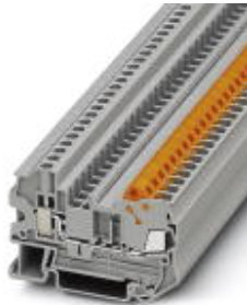
Feed-through terminal block, Connection type: Quick connection, Screw connection, Cross section: 0.5 mm 2 - 2.5 mm 2 , AWG :20- 14, Width: 6.2 mm, Color: gray, Mounting: NS 35/7,5, NS 35/15

Please be informed that the data shown in this PDF Document is generated from our Online Catalog. Please find the complete data in the user's documentation. Our General Terms of Use for Downloads are valid ( http://download.phoenixcontact.com )