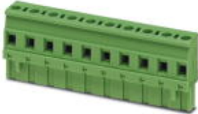
Plug component, Nominal current: 12 A, Rated voltage (III/2): 630 V, Number of positions: 6, Pitch: 7.5 mm, Connection method: Screw connection, Color: green, Contact surface: Tin

Please be informed that the data shown in this PDF Document is generated from our Online Catalog. Please find the complete data in the user's documentation. Our General Terms of Use for Downloads are valid ( http://download.phoenixcontact.com )