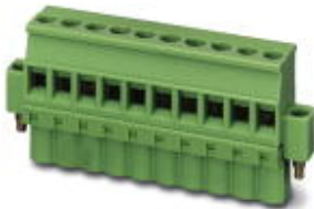
Plug component, Nominal current: 12 A, Rated voltage (III/2): 320 V, Number of positions: 5, Pitch: 5.08 mm, Connection method: Screw connection, Color: green, Contact surface: Tin

Please be informed that the data shown in this PDF Document is generated from our Online Catalog. Please find the complete data in the user's documentation. Our General Terms of Use for Downloads are valid ( http://download.phoenixcontact.com )