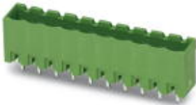
Header, Nominal current: 12 A, Rated voltage (III/2): 320 V, Number of positions: 7, Pitch: 5 mm, Color: green, Contact surface: Tin, Assembly: Soldering

Please be informed that the data shown in this PDF Document is generated from our Online Catalog. Please find the complete data in the user's documentation. Our General Terms of Use for Downloads are valid ( http://download.phoenixcontact.com )