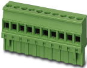
Plug component, Nominal current: 12 A, Rated voltage (III/2): 320 V, Number of positions: 7, Pitch: 5 mm, Connection method: Screw connection, Color: green, Contact surface: Tin

Please be informed that the data shown in this PDF Document is generated from our Online Catalog. Please find the complete data in the user's documentation. Our General Terms of Use for Downloads are valid ( http://download.phoenixcontact.com )