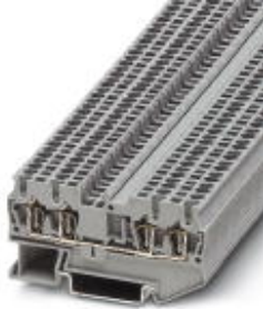
Feed-through terminal block, Connection method: Spring-cage connection, Cross section: 0.08 mm 2 - 1.5 mm 2 , AWG: 28 - 16, Width: 4.2 mm, Color: gray, Mounting type: NS 35/7,5, NS 35/15

Please be informed that the data shown in this PDF Document is generated from our Online Catalog. Please find the complete data in the user's documentation. Our General Terms of Use for Downloads are valid ( http://download.phoenixcontact.com )