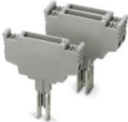
Component plug, with light indicator, to connect 2-pos. components into the basic terminal block, height: 19 mm, color: Gray, voltage light indicator: 24 V DC

Please be informed that the data shown in this PDF Document is generated from our Online Catalog. Please find the complete data in the user's documentation. Our General Terms of Use for Downloads are valid ( http://download.phoenixcontact.com )