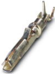
Rolled female contact, single contacts, silver-plated, 0.5 mm 2 ... 1.5 mm 2

Please be informed that the data shown in this PDF Document is generated from our Online Catalog. Please find the complete data in the user's documentation. Our General Terms of Use for Downloads are valid ( http://download.phoenixcontact.com )