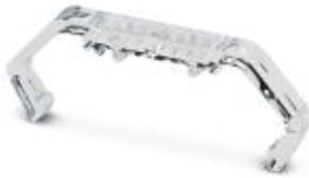
Single covers, color: transparent

Please be informed that the data shown in this PDF Document is generated from our Online Catalog. Please find the complete data in the user's documentation. Our General Terms of Use for Downloads are valid ( http://download.phoenixcontact.com )